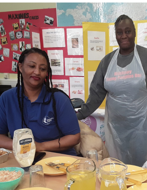
Clockwise from top left: WHEAT Mentor Support Trust, Skillspool Training CIC, Turkish Cypriot Cultural Association, Hackney Young People's University, Gascoyne 1 Community Centre.